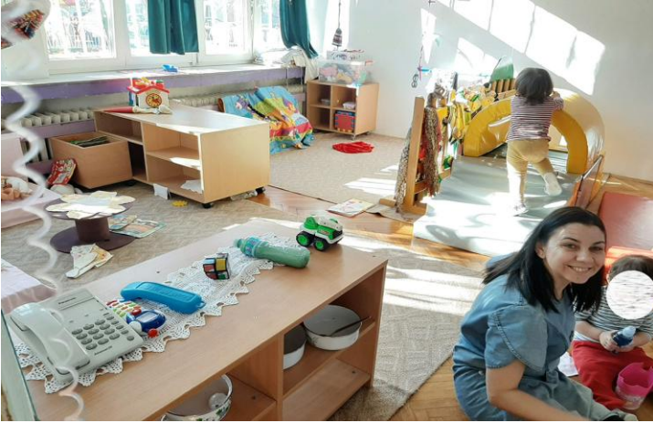
RC Bor-GG 2120208 -“Years of Ascent”, special equipment for kindergartens, budget $65,120.00