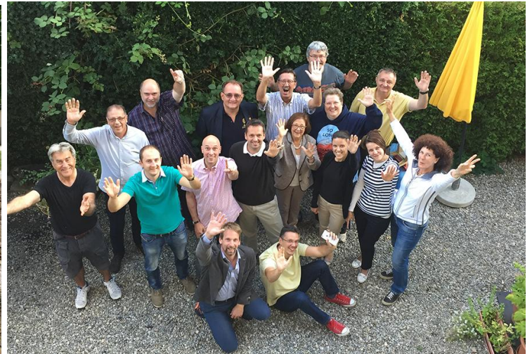
... in Bern