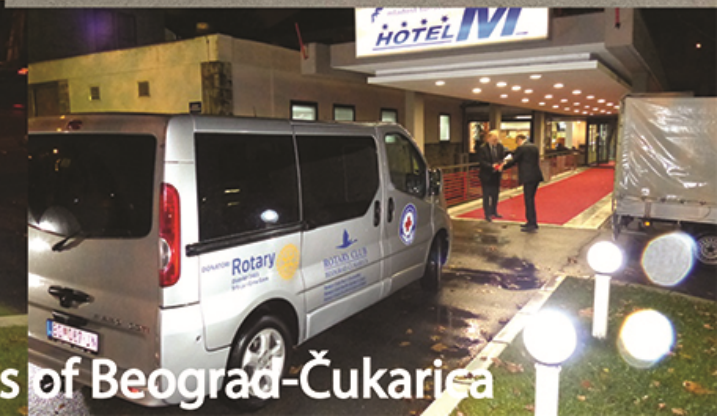
Mini van for the Red Cross of Beograd-Čukarica