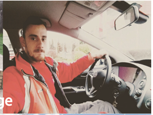
Funds for Children's village