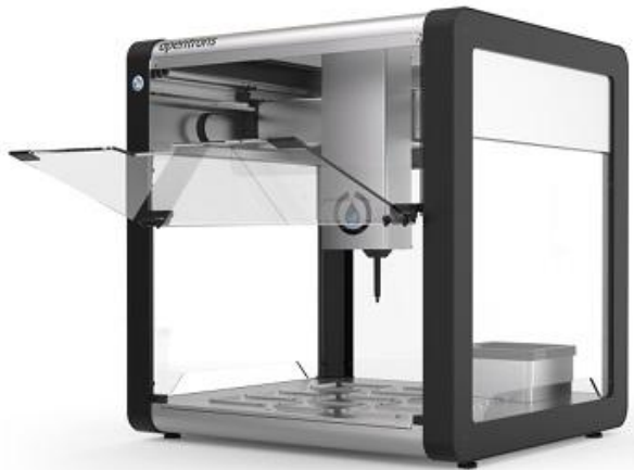
RC Cacak-GG 2118569 , “Stop Covid 19”, equipment (PCR) for COVID-19 detection, budget $148,080