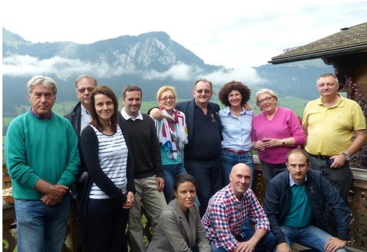
... in Bern...