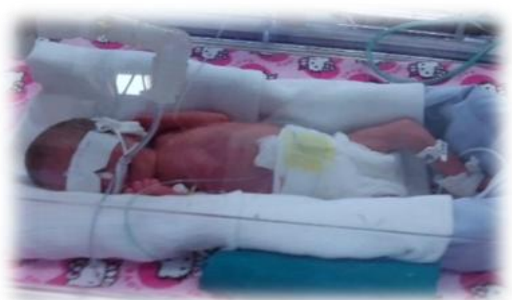
RC Bar-GG 2125676 , “Bring to Life”, medical equipment for prevention of preeclampsia, budget $72,600.00