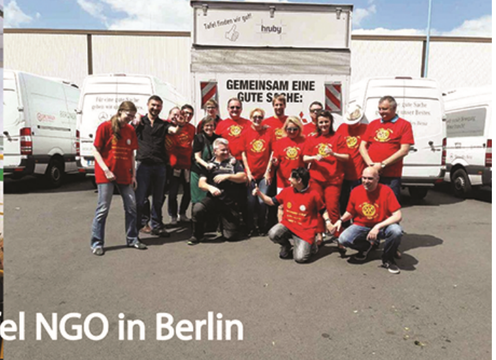
Volunteering for Tafel NGO in Berlin