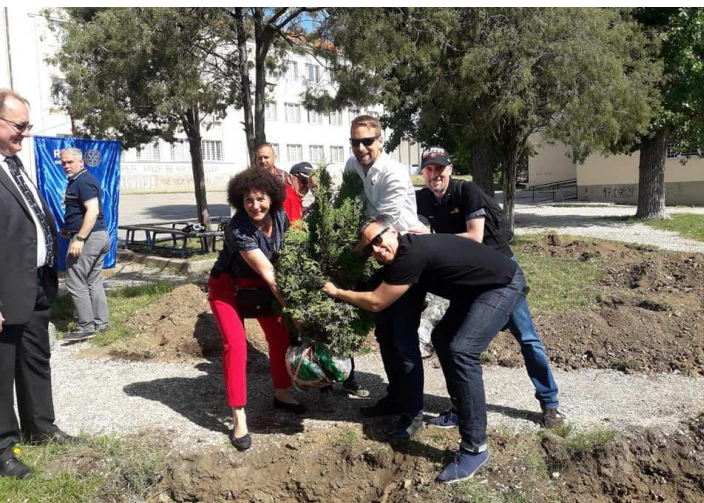
... in Bor