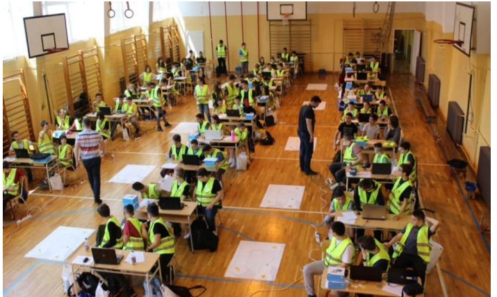
RC Senta-GG 2119523 , “Rotary District 2483 for 100 schools”-M-Bot robots, budget $76,185.00