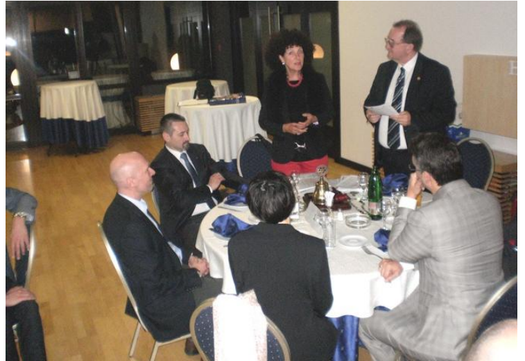
... in Belgrade