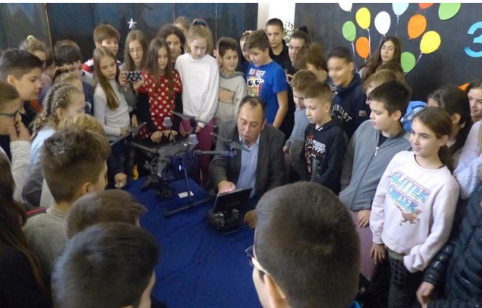
RC Sremska Mitrovica-GG 2118834 , “Drones for ICT Classrooms”-Drones for programming languages Scratch and Python, budget $117,200.00