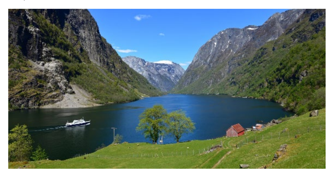
Finally, you will be back in Bergen where you stay from the 17<sup>th</sup> to the 19<sup>th</sup>.

Then it will be time to say goodbye and leave. You will leave Norway from Bergen Airport Flesland.